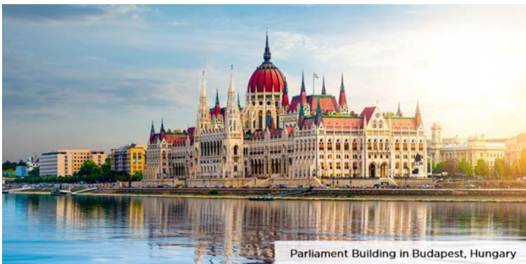
Parliament Building in Budapest, Hungary