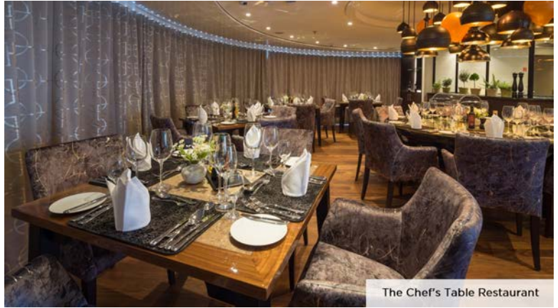
The Chef's Table Restaurant